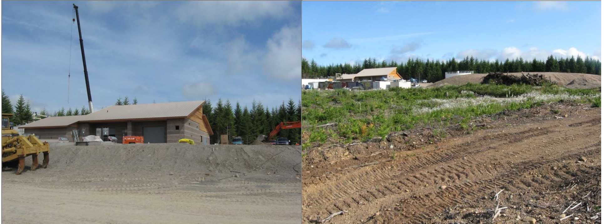
Interim Rate Ordinance Public Meeting, July 12, 2011 - Belfair Wastewater and Water Reclamation Facilities Project