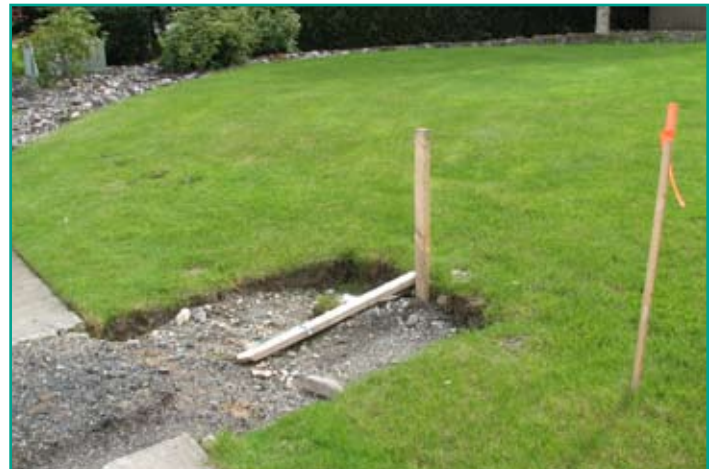
Property owners will need to build side sewers from their building to property lines, where the county utility will provide one stub (shown here), or pipe connection, per parcel.

Property owners within 500 feet of the proposed sewer alignment will be required to hook into the system as it becomes available ( per Mason County Ordinance 91-07 ). If tying into the sewer system is applicable to your property, you should have received a letter with details about your hookup. If you have questions, please call the project hotline.